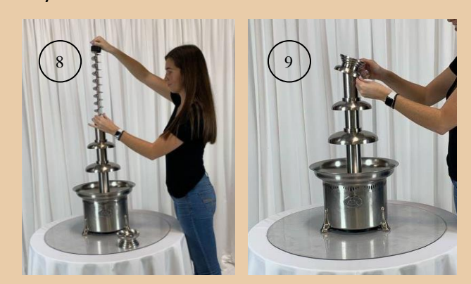
Step 9: Place the crown on top of the cylinder

Step 8: Place the auger inside the cylinder with the plastic retainer at the top and the notch at the bottom. Turn the auger by hand until the notch rests on top of the motor shaft and the auger stops turning freely.